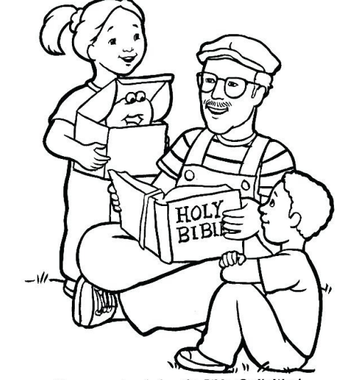
We can read and obey the Bible, God's Word.

Now read it again. Eph 6:1-4 "Children, obey your parents in the Lord, for this is right. (2) HONOR YOUR FATHER AND MOTHER (which is the first commandment with a promise), (3) SO THAT IT MAY BE WELL WITH YOU, AND THAT YOU MAY LIVE LONG ON THE EARTH. (4) Fathers, do not aggravate your children to anger, but bring them up in the discipline and instruction of the Lord."